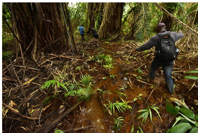
Team of Liberian biologists and CI research scientists exploring remote sections of forest to collect observations about ecosystems.

NCA-derived statistics (e.g., changes in an ecosystem's area and its related ability to provide global climate regulation services), combined with other socio-economic data can help to identify Nature-based Solutions (NbS) 1 for climate, furthering more sustainable, cross-sectoral economic policy and planning.